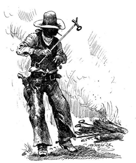
"Iron's ready. Where are the PBCs?"

First Class delivery to a First Class Clamper at: