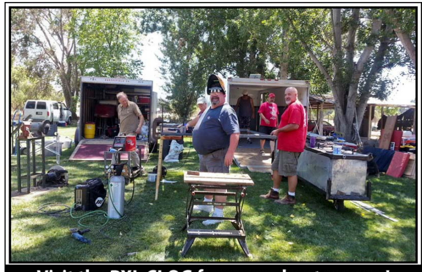
Visit the PXL CLOG for more chapter news!

And if you think about it, that's how it should be. At PXL we don't provide the booze, but do make sure you get breakfast lunch and dinner as part of your rub. Saturday Morning we have our traditional Humbug's Pot Luck where no one ever goes away hungry. We provide the eggs and you bring the breakfast meat, cheese, potatoes, tortillas, etc. Our Graybeards and PBC provide the magic.