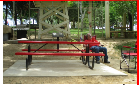
Pictured above is Pokey on prep day one week prior to the arrival of the PXL Table Detail.

Camp Hamilton offered the pad, next to our original bench, to the Chapter as Clamper Territory . Following raffle this was made known to the brothers. Funds were collected for a round red table to be placed on the newly acquired area. Before the night would end we had a commitment for a total of three round tables. The tables were ordered on 8 June and on 9 June Top Turner and Pokey Crawford went to Camp Hamilton to clean and prepare the slab area for the new tables.